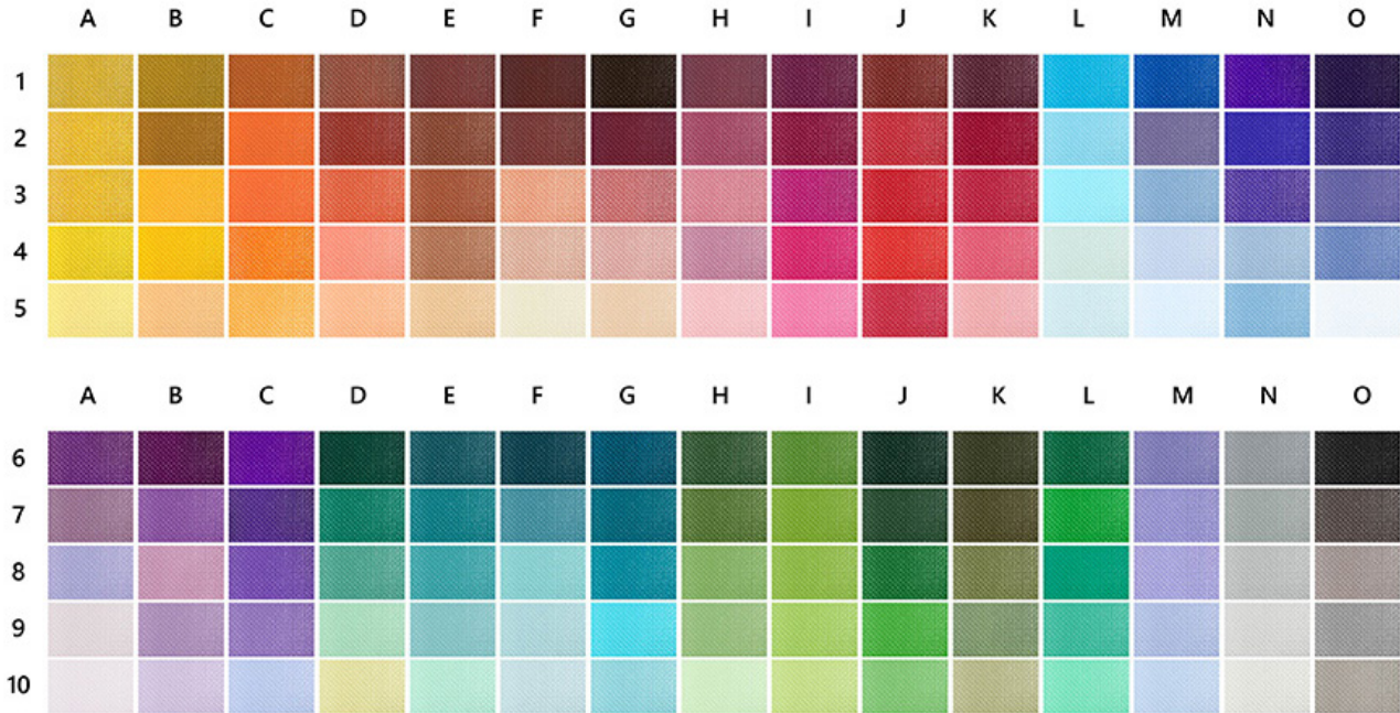
Colors may vary due to inconsistencies of various display monitors or printers (if you're viewing a printed version of this document). Color images are intended to be used as a guide only.