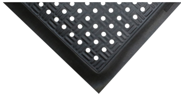
Cushion Station with drainage holes