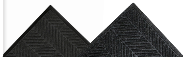
Fashion Fabric Border