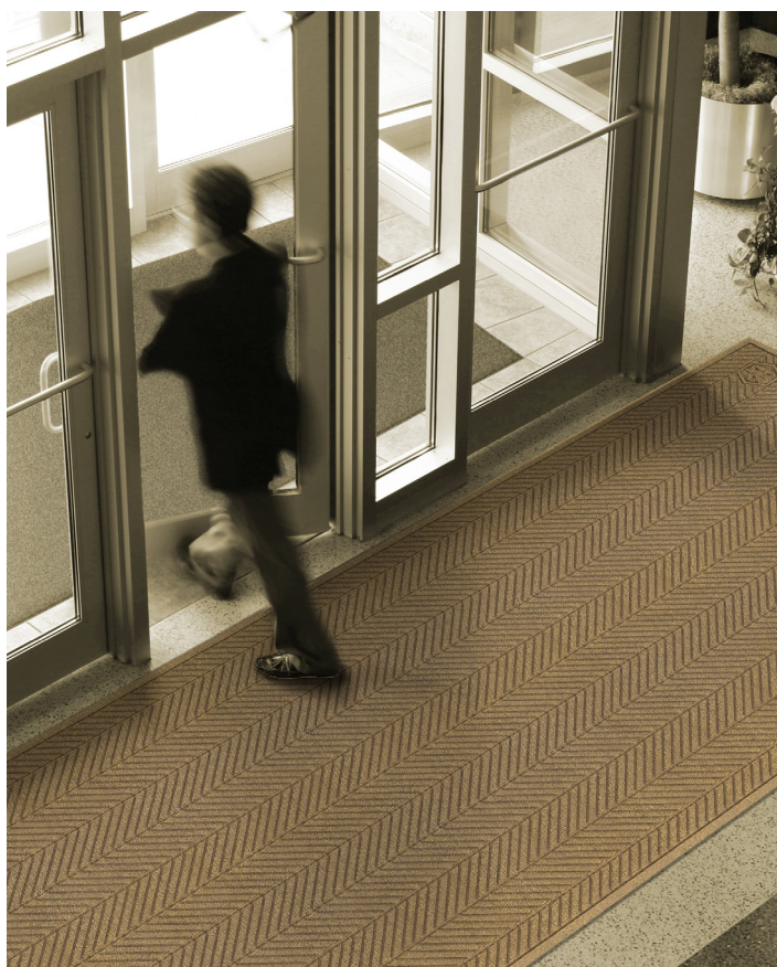
Classic Rubber Border

Mat sizes are approximate as rubber shrinks and expands in conjunction with temperature and time. Tolerable manufacturing size variance is 3-5%.