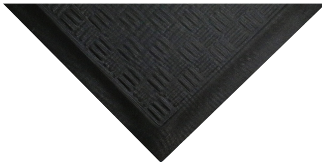
Comfort Station Max